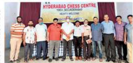
New Initiative: The members of the Hyderabad Chess Centre, which was formally launched at Secunderabad YMCA.

"We are lagging far behind. But, we (former players) have decided to make a beginning. Since there are a lot of chess academies but no playing halls, we decided to start one for the benefit of the players who are not able to find a place and also quality