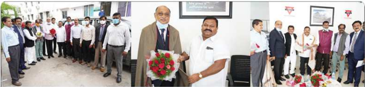
President, Board of Directors, Secretaries with Regional Delegation

The following dignitaries of the inspection committee from SEIROY, constituted by NCYI visited YMCAs of Greater Hyderabad, Secunderabad on 30th June 2021. The delegation which was escorted by the President, General Secretary and Secretaries of YMCAs of Greater Hyderabad to all the three buildings thoroughly, they have taken into account of the recent tremendous developments with regards to the construction, Renovation, New tenants, New Projects, New Activities/ Programs and the rise in annual Income etc.