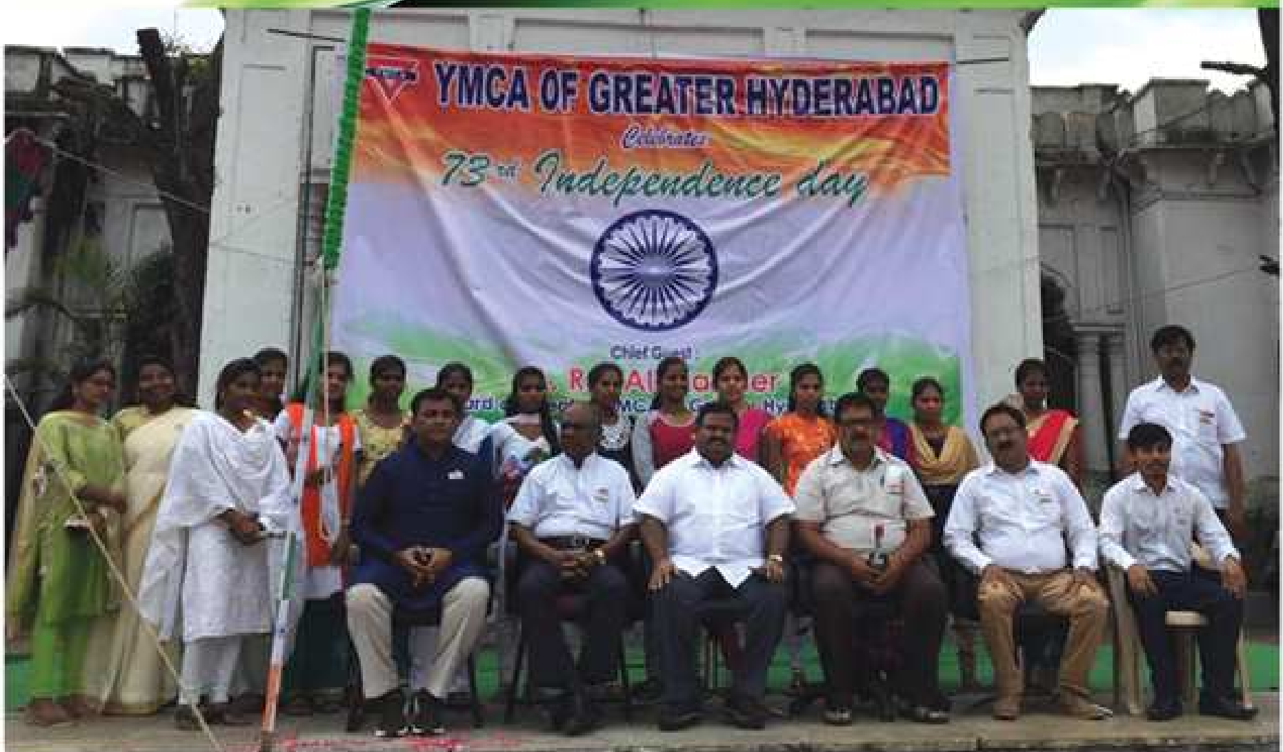
President and Board of Directors on Independence Day Celebration

It is always a great honour and a pride movement to remember the sacrifices of our freedom fighters fought from 1858 to 1947 against the colonial rule. Every Indian across the globe remembers and celebrates this auspicious day, the