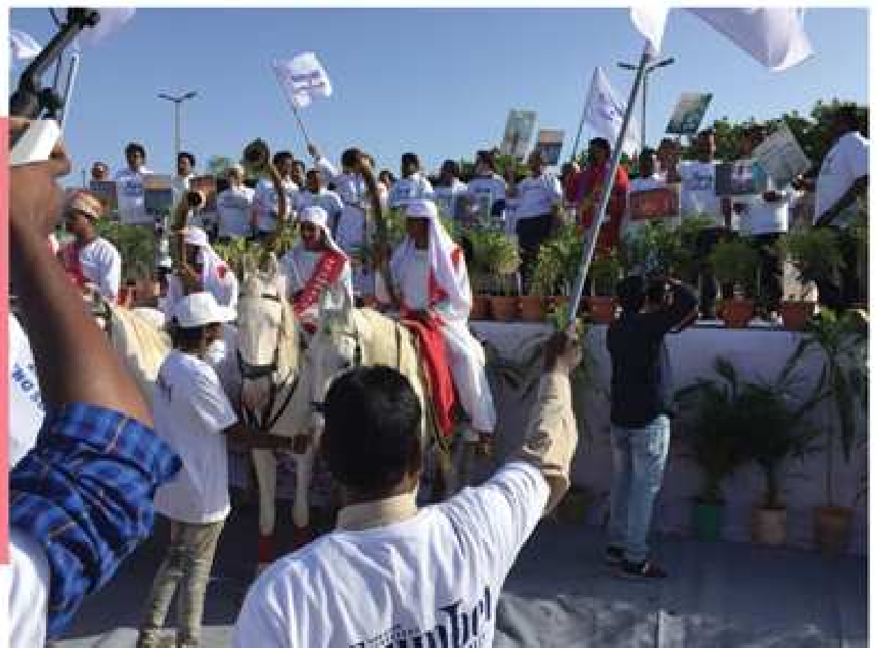
Trumpet Festival Rally @ Hyderabad