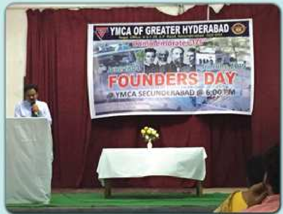
General Secretary on Founder's Day Celebration

June 6, 1844 marks the historic movement remembered globally when Sir George Williams Founded YMCA in England. This is the most prestigious programme celebrated by the YMCA'S across the world. Remembering the hardships, sacrifices, strivings, and dedication of the great men in order to make it an international movement which would help the young men/women to get the needed nourishment in building their career while catering /fostering the community.