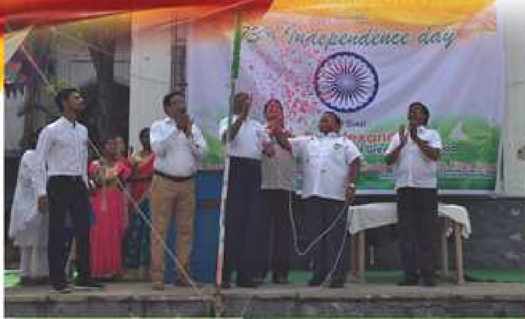
President and Board of Directors Hoisting the National Flag