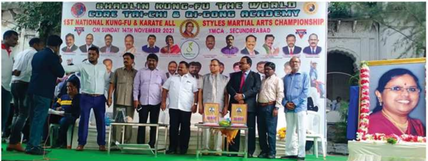
Dignitaries on the Dias at YMCA Secunderabad