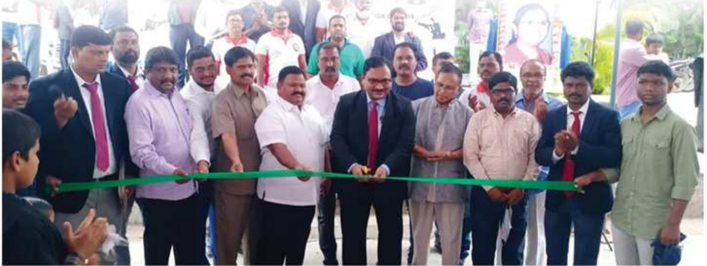
President YMCAs of Geater Hyderabad, Chairman-Latha Raj Foundation and Secerteraries