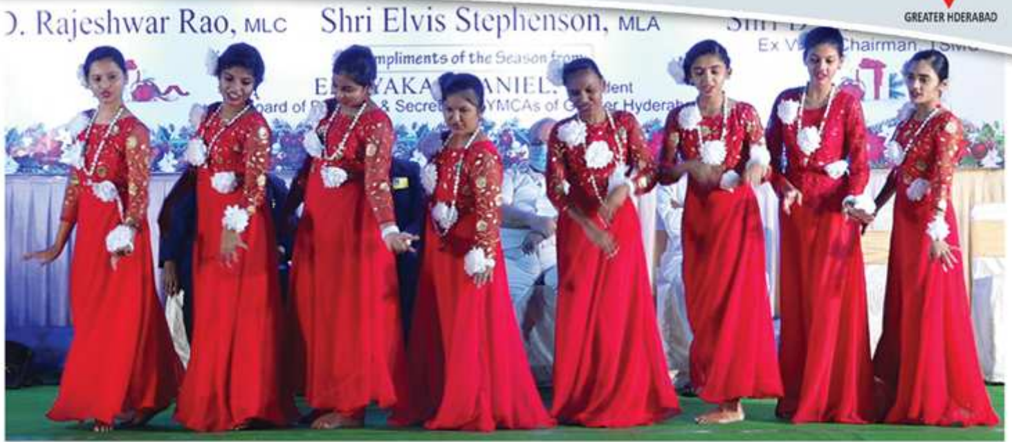
Choreography by St. Andrews School Girls, Maktha, Begumpet