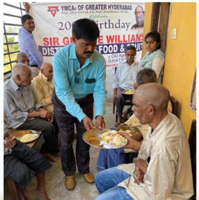
Distributing Food and Fruits