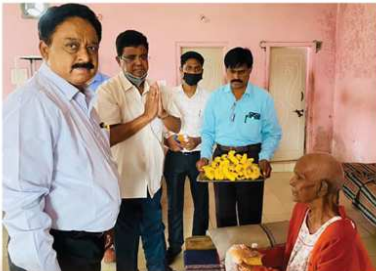
Distributing Food and Fruits