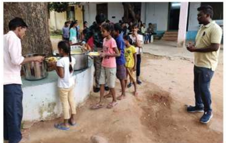
Day -5 at Canaan at Ghatkesar