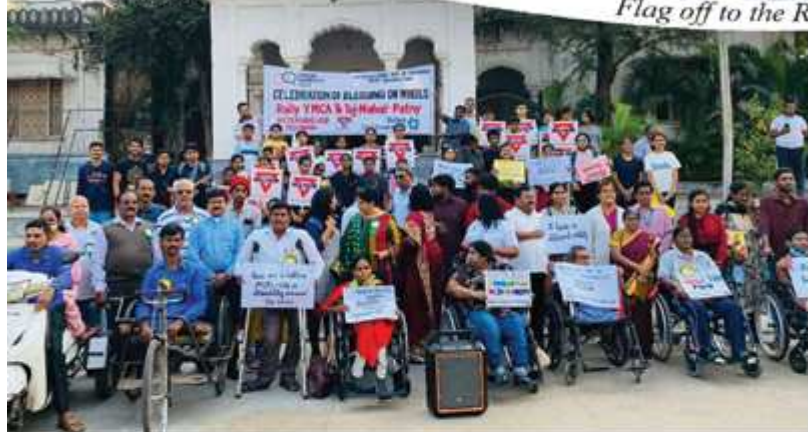
at YMCA Secunderabad