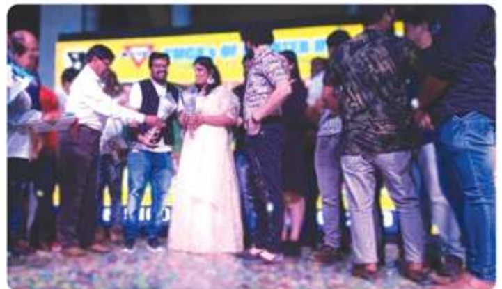
▲ Renowned Choreographers with Secretaries, YMCAs of Greater Hyderabad ▼