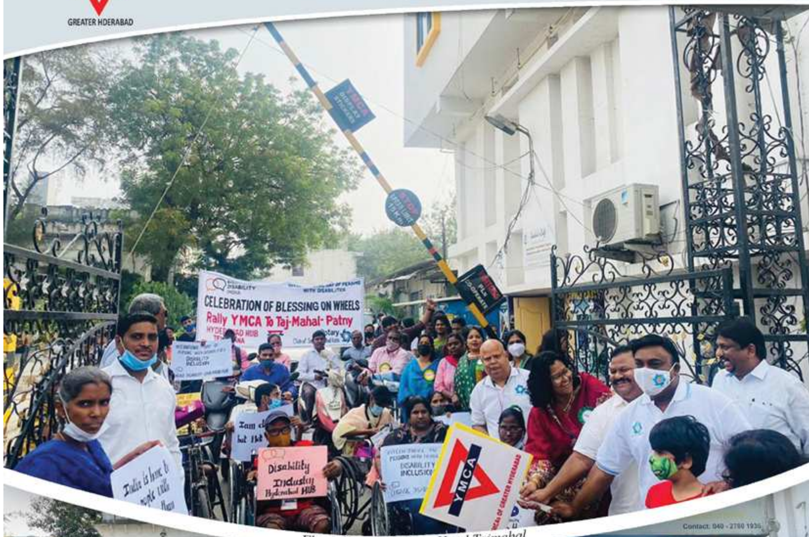
Flag off to the Rally to Hotel Tajmahal